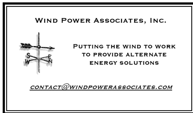
Business Card 3 1/2" x 2"