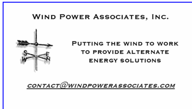
Business Card 3 ½" x 2"